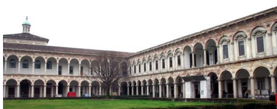
Università degli Studi di Milano (Italy)