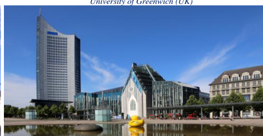
University of Leipzig (Germany)