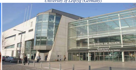
Université de Rouen (France)