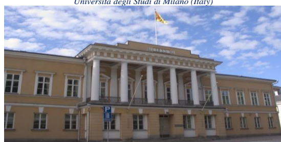
Åbo Akademi University School of Business and Economics (Finland)