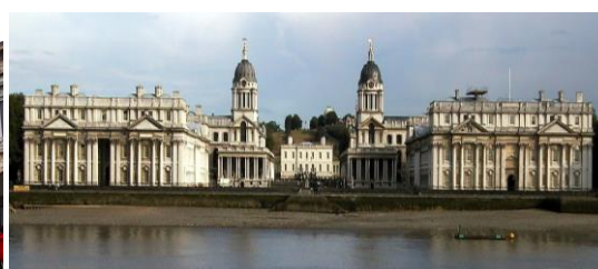
University of Greenwich (UK)